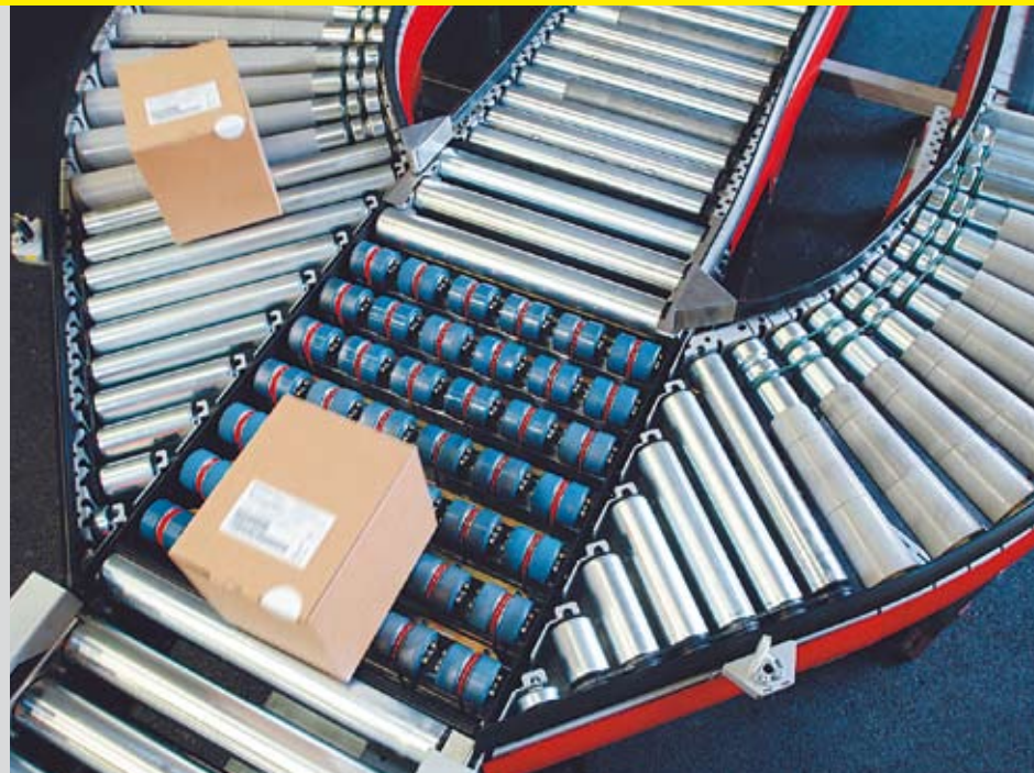
▼ High performance package - Merge