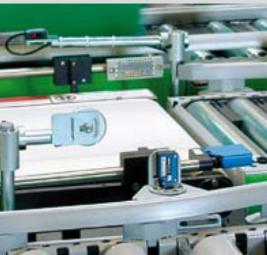
Conveyingsystem profile ▼