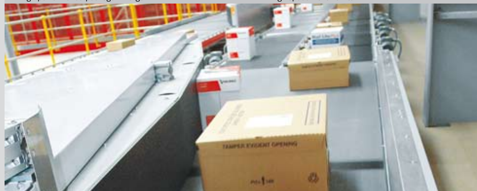
▲ High-speed Roller Switch